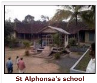
St Alphonsa's school

In the evening, before dinner, we took a short trip to see their nearby church, school (where Saint Sister Alphonsa taught), and cemetery (where all members of a house share a crypt). Then we came back home for a few a few attempts at indoor cricket.