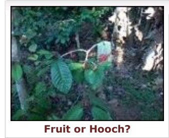
Fruit or Hooch?

on the first day that they enclose near-ripe fruits in plastic to keep the insects and birds away in a non-pesticide