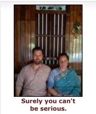
Surely you can't be serious.

don't smile very much in pictures. In fact, they'll be laughing and smiling, then a camera comes out and everyone stops smiling. Maybe it's a cultural thing not to show teeth or something.