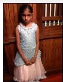
I'd like to thank the academy...