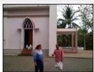
with cousin at church

In the evening, before dinner, we took a short trip to see their nearby church, school (where Saint Sister Alphonsa taught), and cemetery (where all members of a house share a crypt). Then we came back home for a few a few attempts at indoor cricket.