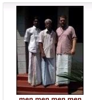
men men men men