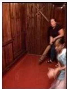
oop. are you okay?