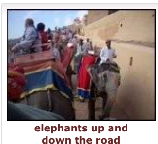
elephants up and down the road

....update. It's now an hour later. I decided to go up to the tandoori restaurant anyway. Ordered a drink.