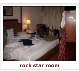
rock star room

(everyone in India does seem to be OK with everything) and looked forward to having a day off. Amy took some time to freshen up in the room, while I wandered around our local area trying to find an internet spot (our hotel is charging over $26 a day for WiFi, which just seems wrong and I wasn't going to stand for it). It took a while, but eventually I found a nice internet café (conveniently located next to a tasty pastry shop) who would let us plug in a laptop for 15 rupees (less than 40 cents) per hour, so I came back to the hotel, got Amy and the laptop, and went back for enough time to post a bog before the internet "café" closed. The internet "café" was in a small room down a hallway, with 4 kiosks with old-ish looking computers and a man sitting at a desk. Behind him was an old printer.