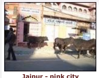
Jaipur - pink city

With our mission so smoothly accomplished the driver took us back to our hotel. We were concerned that we'd deprived him of a couple of days driving, but he seemed OK with it