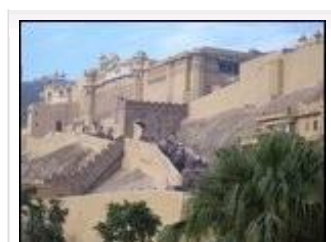
view from the bottom of the fort/palace