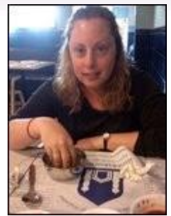
Clean hands club.

Hyderabad), chicken kebabs, and a veg appetizer (I can't remember the name but it was in a doughy crust and was great). We