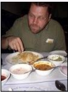
Proper eating etiquette?