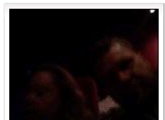
Movie theater. No pictures please.