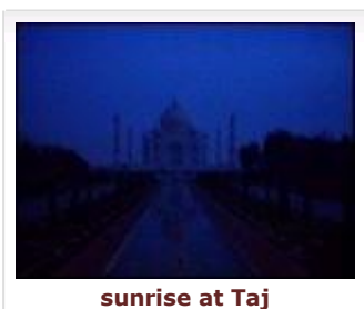
sunrise at Taj

We walked toward the gate, through a security checkpoint, and bought a ticket. The ticket cost 750 rupees per person (approx.$19) and included a bottle of water and a cloth wrap to put over shoes for entering the Taj Mahal. We walked in near-darkness through a metal detector and were searched by security.