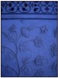
close up of Taj

As we got close to the platform, we put our cloth footies over our shoes and walked up the platform to the building. We were able to walk around the entire building, which (again) is massive and much larger than we had realized. Despite the large number of