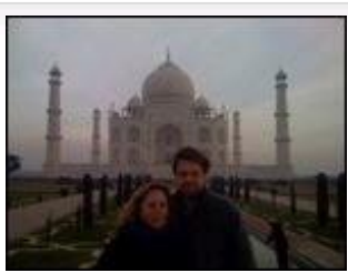
Taj Mahal at sunrise