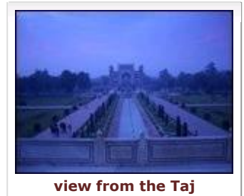
view from the Taj