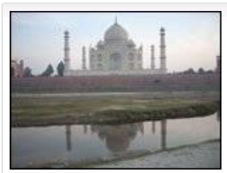
Taj Mahal reflected in river

Shabbu drove us back to the hotel, and we arranged to meet him at 6:00 in the morning to see the Taj at sunrise.