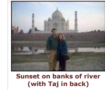
Sunset on banks of river (with Taj in back)

was stunning, especially reflected in the water.