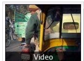
movie - Agra street scene

When we arrived in Agra, we were met by a sea of auto rickshaws. We were approached by a young man, who showed us a card with a list of set fares. We decided to go with him, and we chatted with him for a while, and decided to hire him to take us around to the sites for the rest of the day and the next morning. First we went to our hotel, which was really nice and fancy, much nicer than I had expected ( www.howardplazahotel.com ).