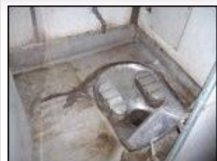
bathroom in train

(tea) to fruit to packets of food in banana leaves. There are also lots of beggars, some horribly deformed, which is heart wrenching and awful. At the train station platforms on the way, vendors sell items through the bars of the train windows. I went to the restroom on the train, and I think I'll include a picture to tell this story: