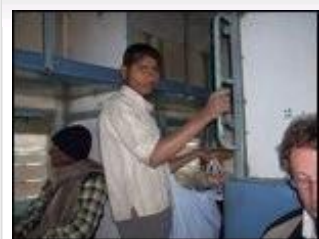
vendor on train

number of bunk beds depends on the class of train, 2 for 1st class, 3 for 2nd class. On the train is a continuous parade of vendors selling everything from chai