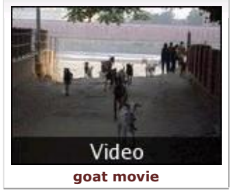
Video goat movie