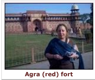
Agra (red) fort

There were hundreds and hundreds of tourists also visiting the fort, which was built by the son of Shah Jahan (the moghul who built the Taj Mahal), who later