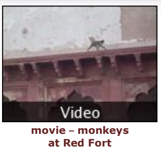
Video movie - monkeys at Red Fort

There were many horse-drawn carriages for tourists outside the fort as well. tag:Next,