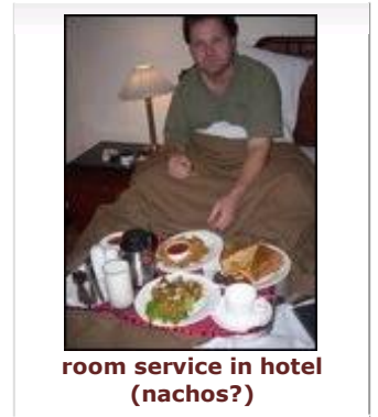
room service in hotel (nachos?)