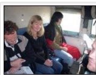
New Zealanders on train

The train car itself was old and dirty, with long vinyl seats, two facing each other (with two overhead for luggage) and one opposite. On overnight trains, the seats fold down into beds, so there are 2 or 3 bunk beds, one on top of the other. The