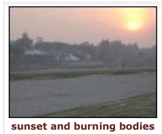
sunset and burning bodies

was stunning, especially reflected in the water.